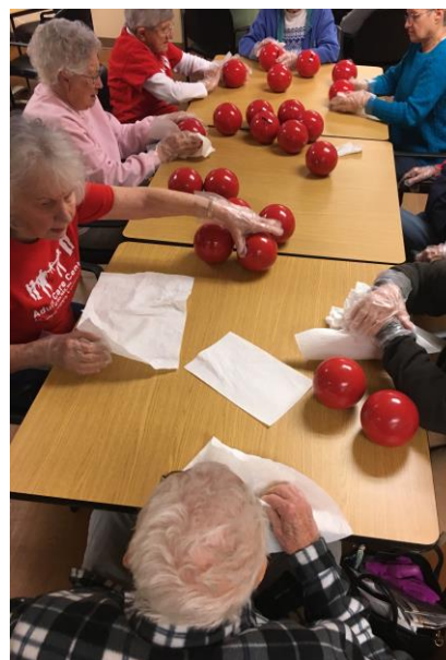
Clean our exercise equipment

“It was also a place I could feel comfortable sending him so I could do errands and take care of other business. He had a great time! There were people he enjoyed laughing and talking with. The ACC gave meaning and pleasure to the last years of his life, in a way I could not alone.”