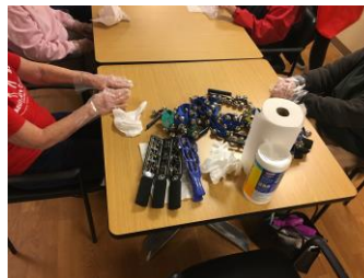
Clean our music instruments